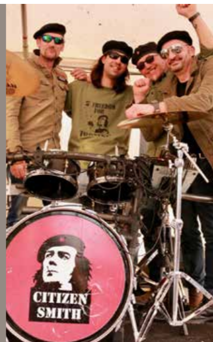
\\ Citizen Smith Thorner Beer Festival, 2018 \\