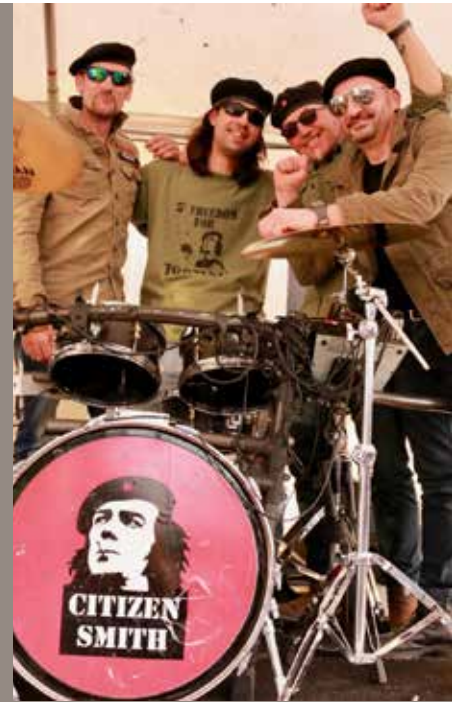
\\ Citizen Smith Thorner Beer Festival, 2018 \\