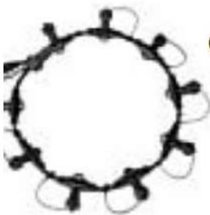
ConnectPro Black Ring Connector